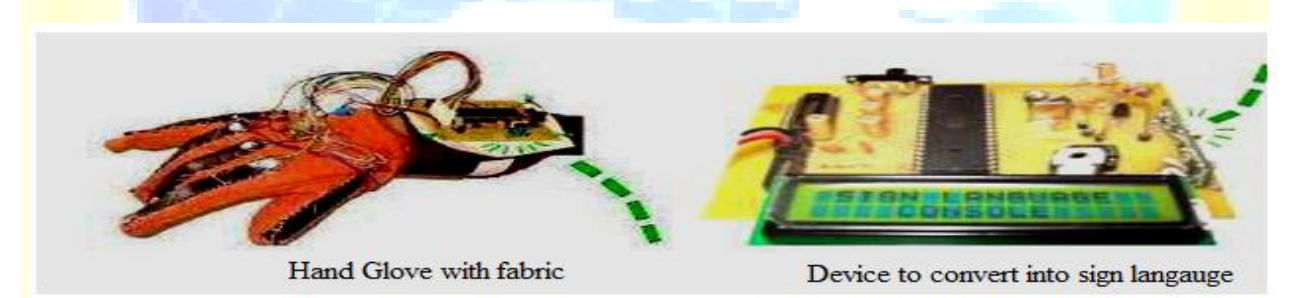
Fig 6. Example of SLC

form and is transmitted to the console unit by using an RF trans-receiver module, which is also mounted on the glove. By combining the sensor output of each finger and the output signal of the accelerometer, we derive the information signal, which is used by the microcontroller to detect the sign. The microcontroller in the console-unit compares the received data with the data, which is already stored in the memory while calibrating the console. When a perfect match is found, the meaning of the corresponding gesture i.e. a word is displayed on the display device. <sup>[2, 8]</sup>