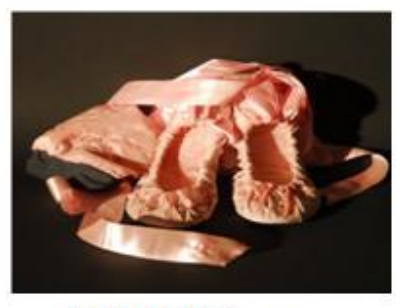
Fig1. LED Shoes

A Monthly Double-Blind Peer Reviewed Refereed Open Access International e-Journal - Included in the International Serial Directories Indexed & Listed at: Ulrich's Periodicals Directory ©, U.S.A., Open J-Gage as well as in Cabell's Directories of Publishing Opportunities, U.S.A. International Journal of Management, IT and Engineering http://www.ijmra.us